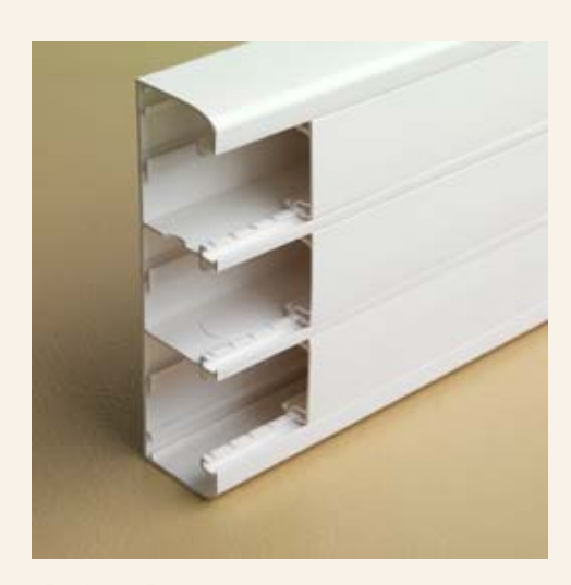
16% 3 corps