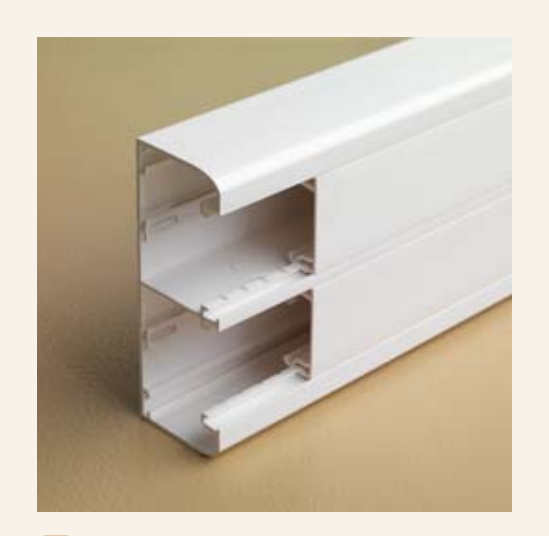
51% 2 corps