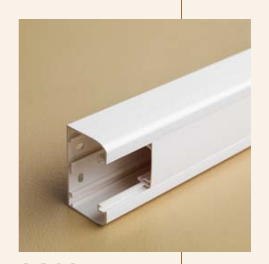
33% 1 corps